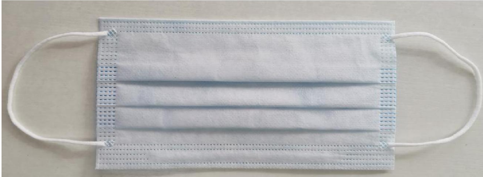
3 ply disposable non-medical face mask with elastic